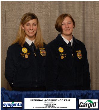
Biochemistry - Alpena