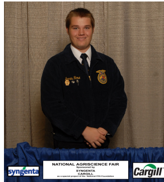
Botany - Alpena