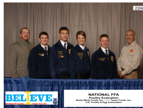
Poultry Eval. - Lincoln