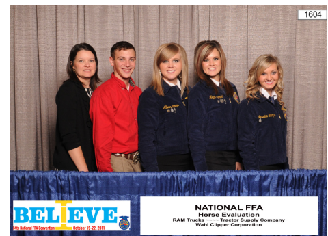
Horse Eval. - Springdale Har-Ber