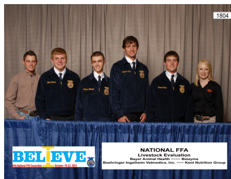
Livestock Eval. - Southside Batesville