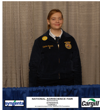
Zoology - Alpena