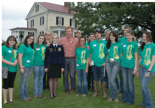
This year showed an increase in activities with industry groups such as the (AGIA) and the Soybean Promotion Board.