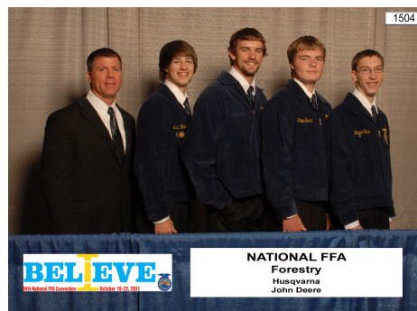
Forestry - Mena