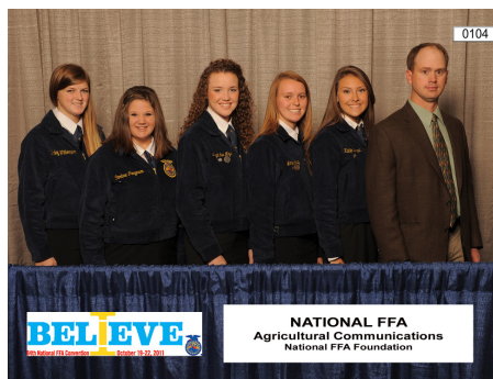
Ag Comm - Prairie Grove