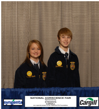
Env. Science - Alpena