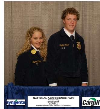
Zoology - Alpena