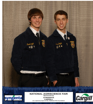
Botany - Alpena